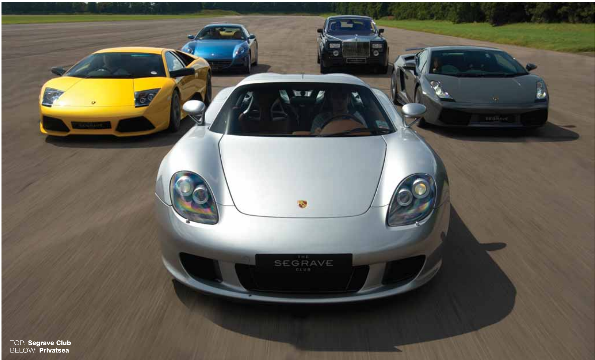
TOP: Segrave Club BELOW: Privatsea